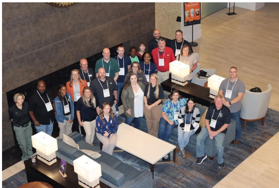
GA IAI members come together for a group photo.

Topics of instruction included crime scene photography, latent print examination, testimony, trace evidence overview, violence against children, resilience training, leadership and management, and so much more. Case studies presented included a crime scene and shooting reconstruction of the murder of Corporal Ronil Singh, the search of the Unabomber's cabin, and the Aurora Colorado movie theater shooting, to name a few.