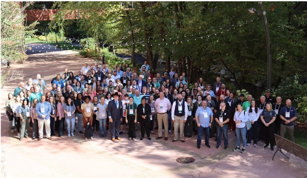
All Joint Educational Forensics Conference attendees come together for a group photo.